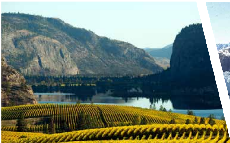
Enjoy the beautiful scenery and wines of Okanagan Valley