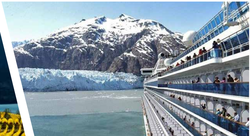
An awe-inspiring view of the Glacier National Park from the Princess cruise balcony