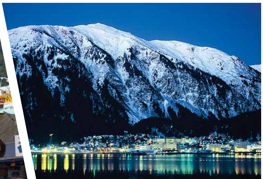
The capital city of Alaska, Juneau