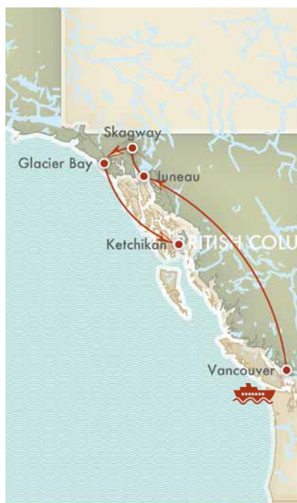
Itinerary maps of the trip