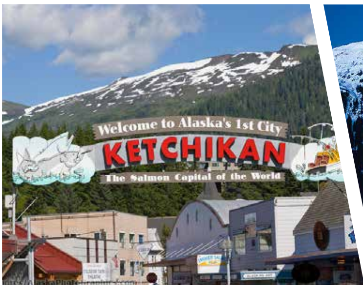
Ketchikan - World's capital of salmon is one of our stops on the Princess Cruise trip