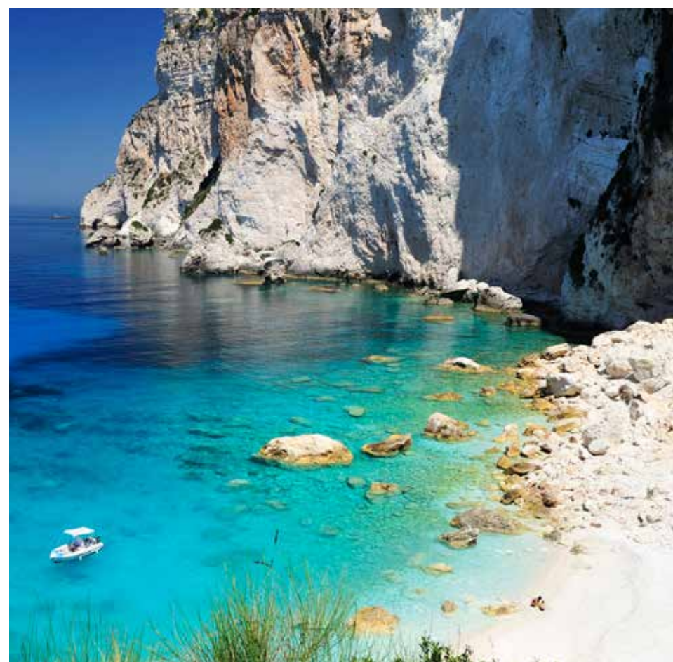
Milos Island, Greece