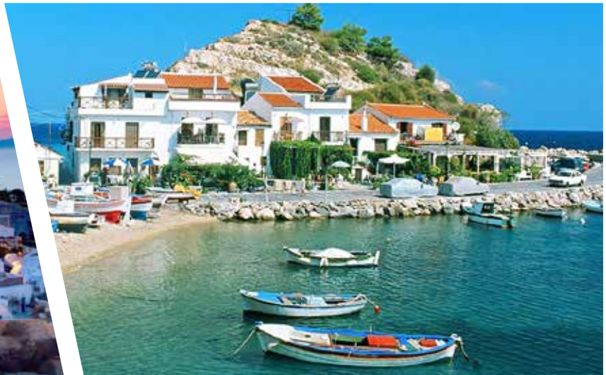
Beautiful Island of Samos (Greece)