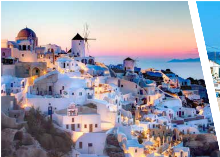
Whitewashed Oia village at sunset on the island of Santorini (Greece)