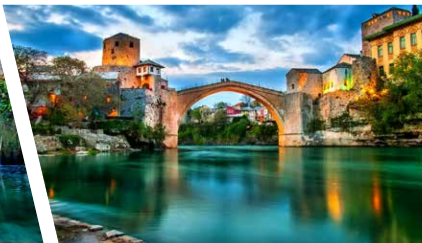
The famous 16th century Old Bridge of Mostar (Bosnia and Herzegovina)