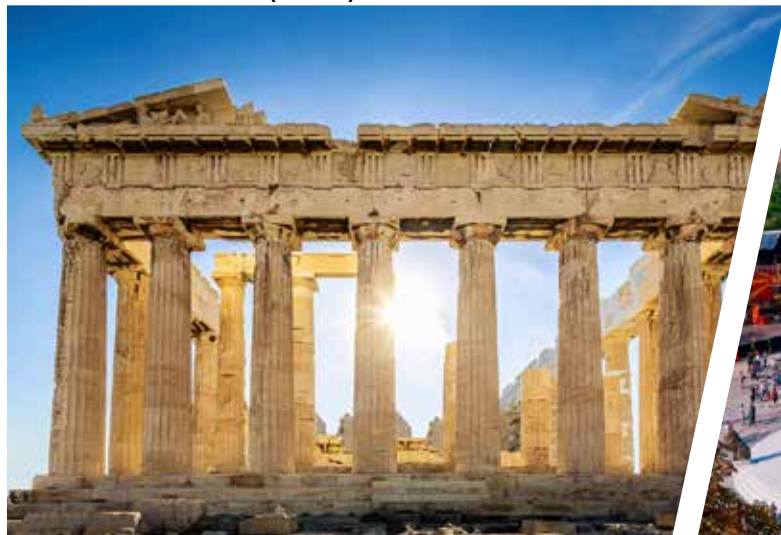
Parthenon ruins in Athen (Greece)