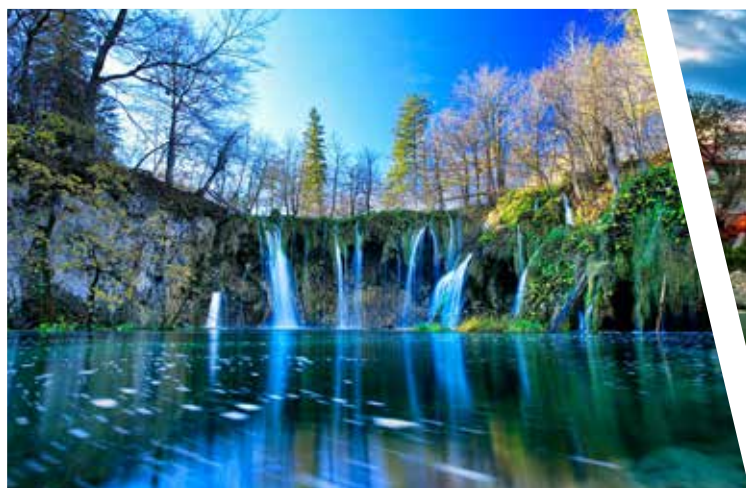
The mesmerising beauty of Plitvice Lakes (Croatia)

Overnight Stay – Cavet Dubrovnik or similar