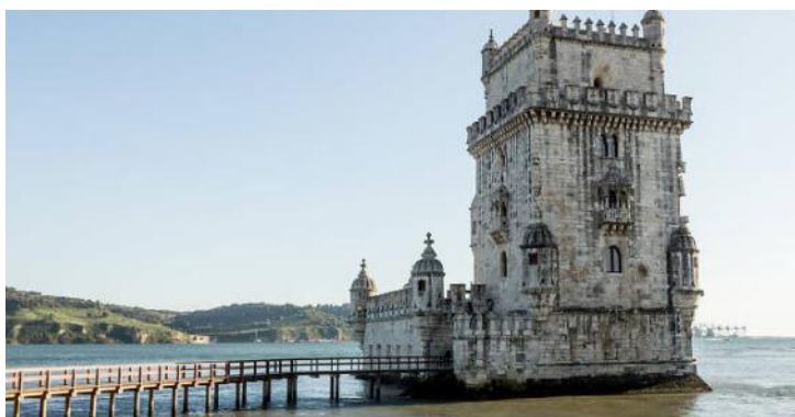
Belem Tower, Lisbon