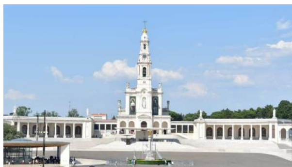
Sanctuary of Our Lady of Fatima