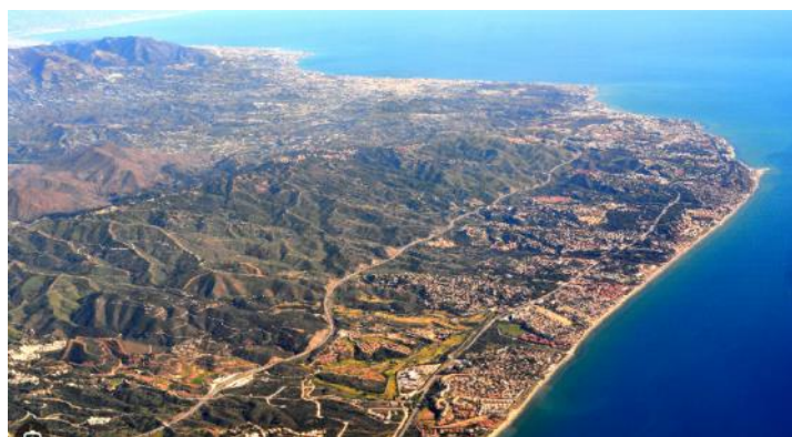
Beautiful coastline of Costa Del Sol