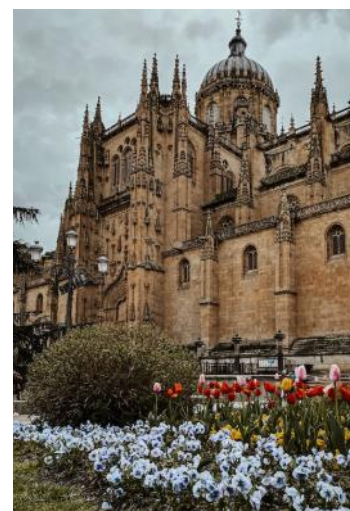
Above - Salamanca