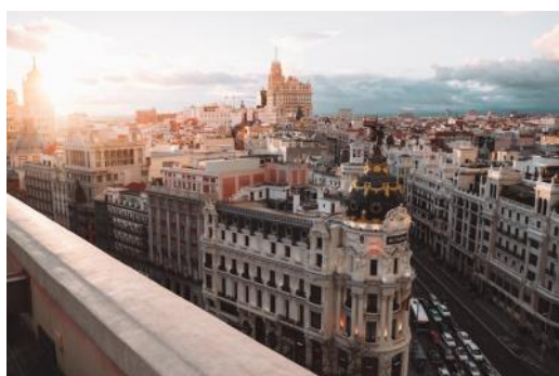
Welcome to Madrid!