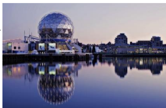
Right — Welcome to Vancouver