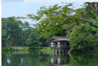
Kenrokuen Gardens (Kanazawa)