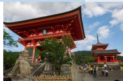
Right - Kiyomizu Temple (Kyoto)