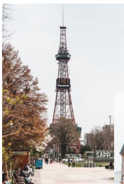
Above—Welcome to Sapporo!