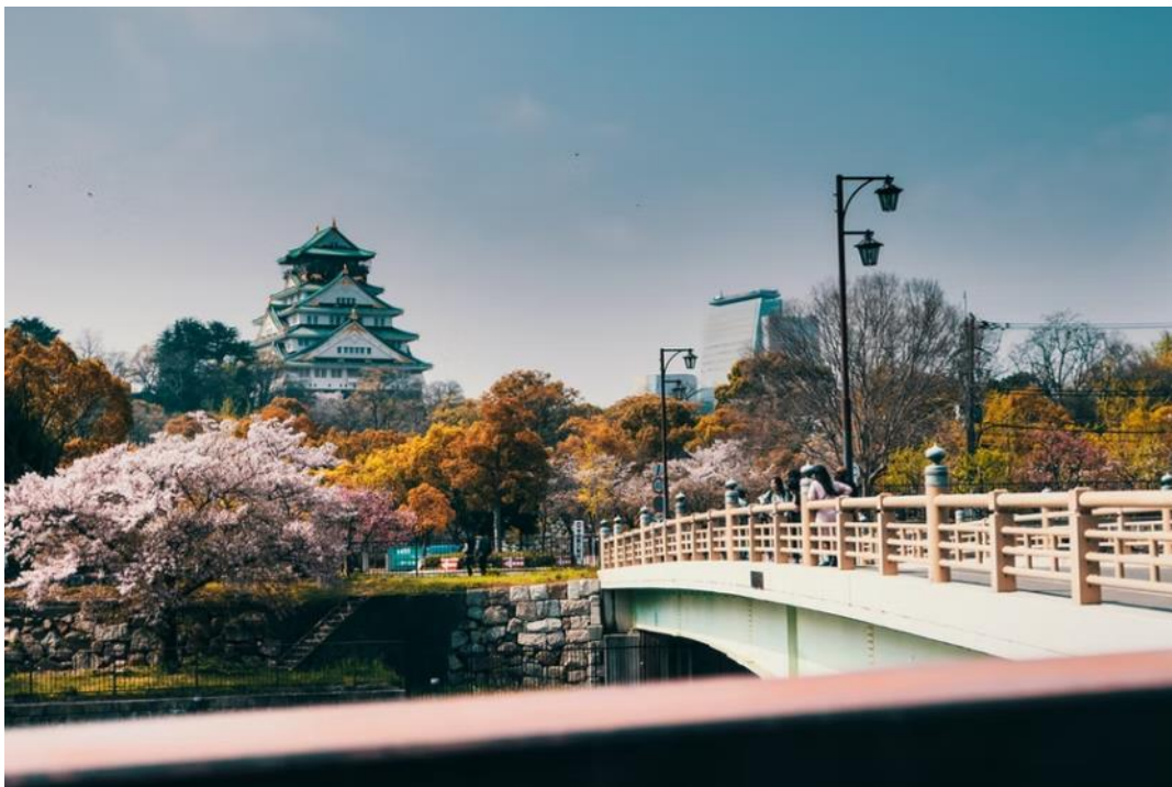
Above - Beautiful Osaka