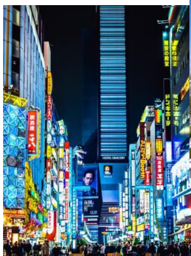
Above— Tokyo City