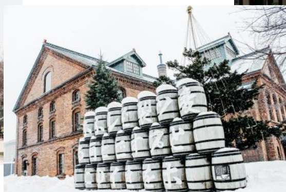
Left —Sapporo Beer Museum