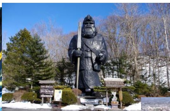
Left—Shiraoi Ainu Museum