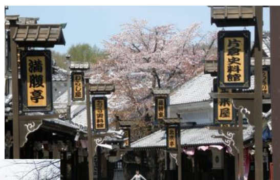
Right — Date Jidaimura theme park