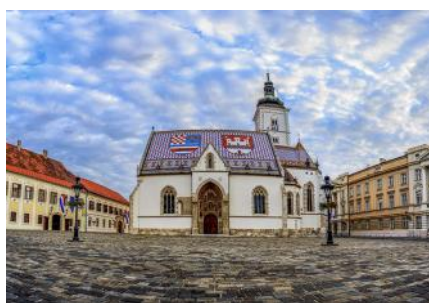
St Mark's Church (Zagreb)