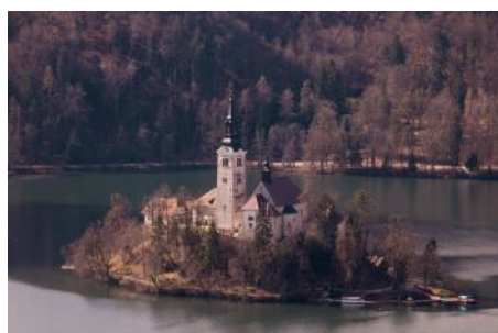
Lake Bled, Slovenia