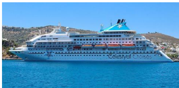
Celestyal Journey Cruise ship