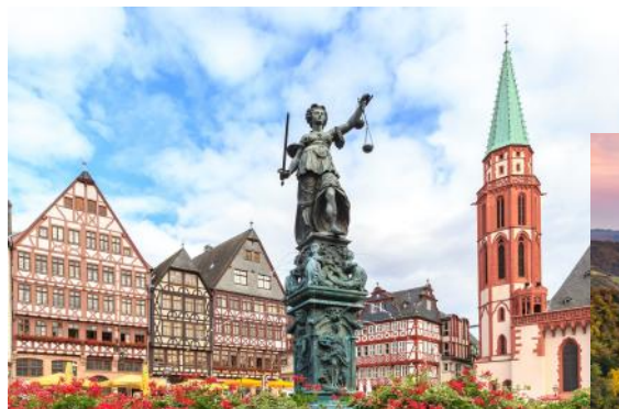
Welcome to Frankfurt