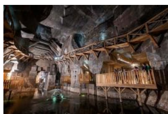
Wieliczka Salt Mine