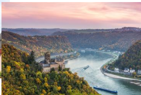
Rhine River Cruise