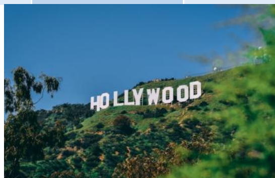
Right — Welcome to Los Angeles!