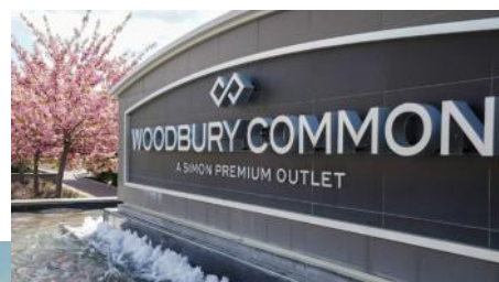
Woodbury Shopping Outlet