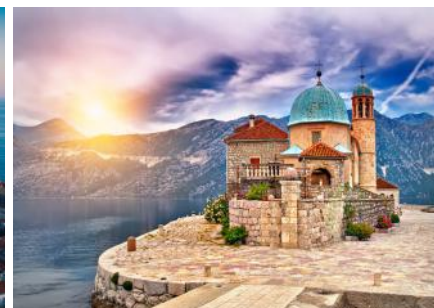
Our Lady of the Rocks (Perast)