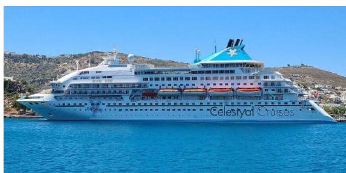
Celestyal Journey Cruise ship