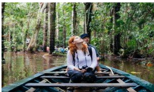
Experience nature and wildlife of the ama-