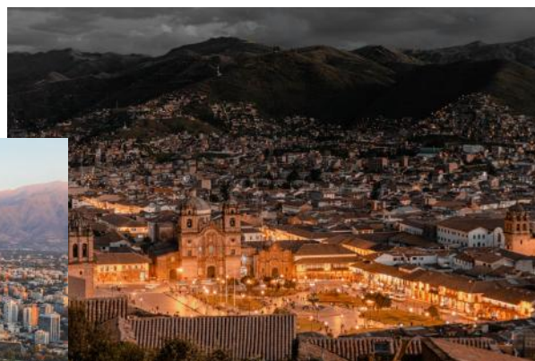
Cuzco City Centre