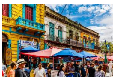
La Boca neighbourhood