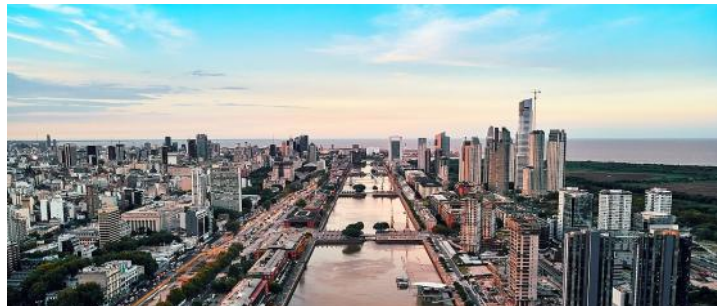
Welcome to Buenos Aires!