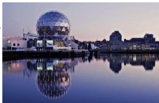
Right — Welcome to Vancouver