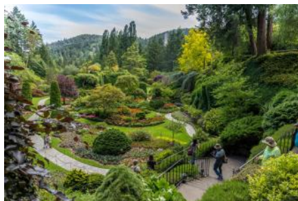
Left —Butchart Gardens