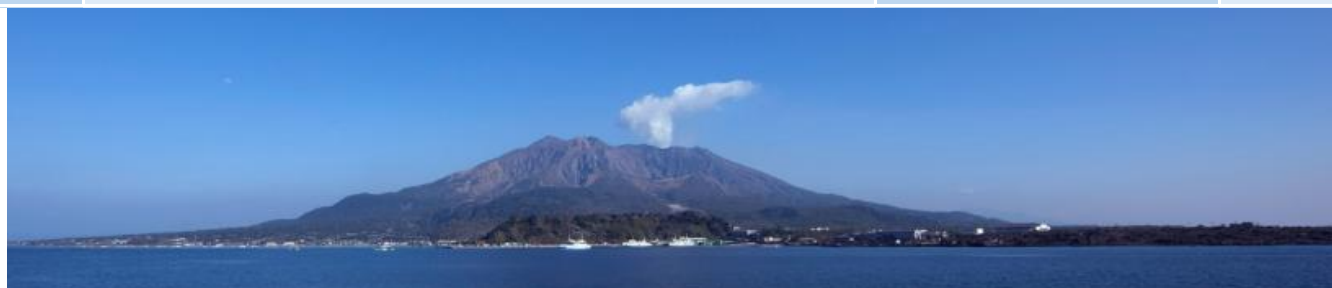
Above— Sakurajima Island