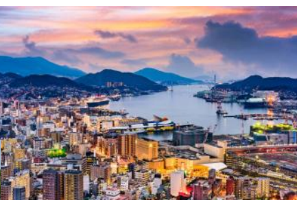
Right — Nagasaki