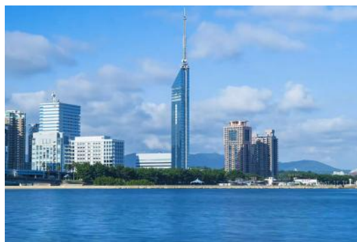
Above - Fukuoka Tower