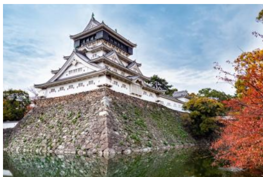
Above - Kokura Castle