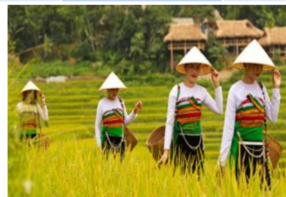
Kho Muong Village