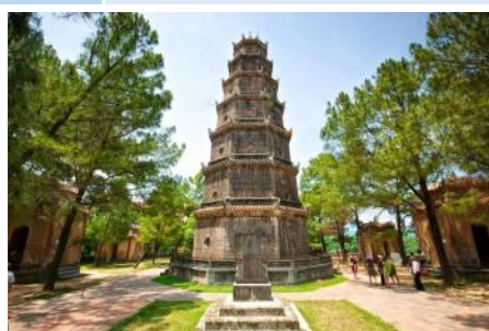
Hue—Thien Mu Pagoda