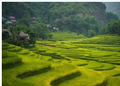
Pu Luong Nature Reserve