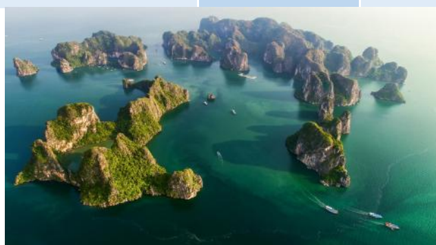
Ha Long Bay