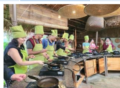
Cooking experiences included!