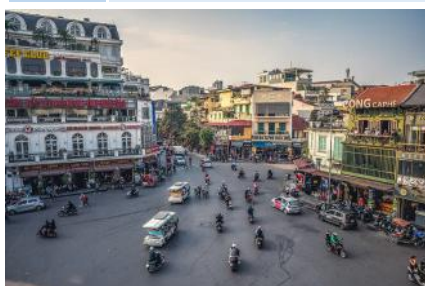
Welcome to Hanoi!