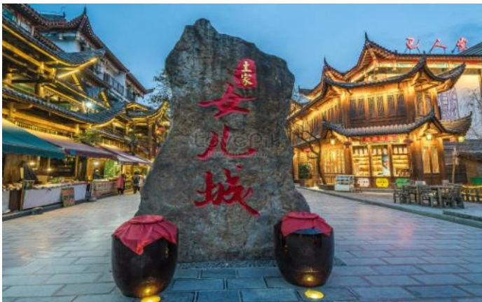
Daughter City (Ernancheng)