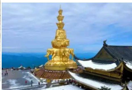
Mt Emei Summit