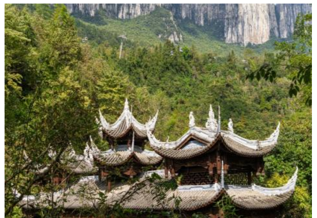
Enshi Grand Canyon