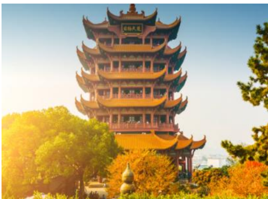
Wuhan Yellow Crane Tower