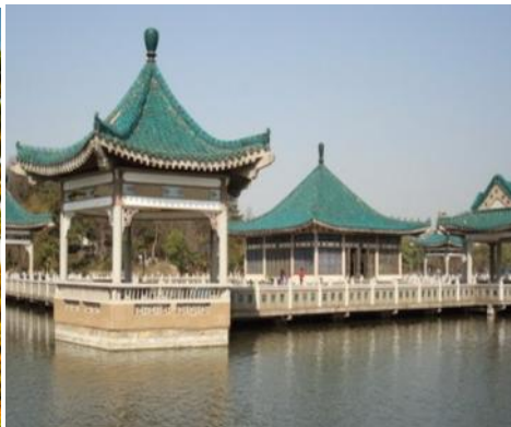
Tingtao Scenic Area