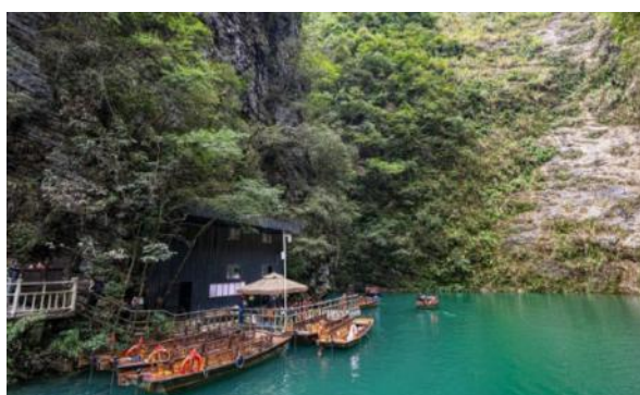
Pingshan Grand Canyon Cruise