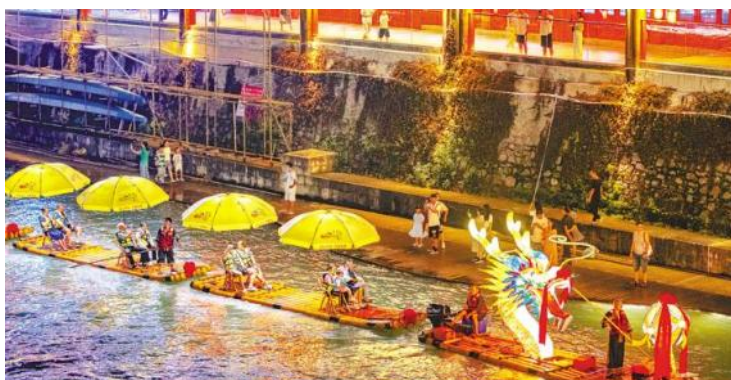
Gongshi River, Xuan'en County