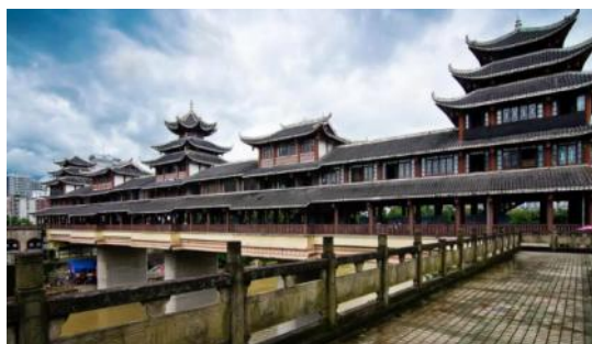
Tusi City Castle