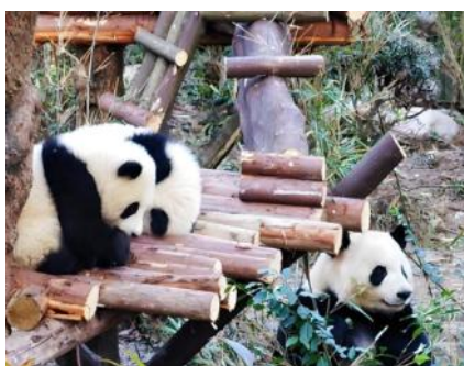
Chengdu - Panda Research Centre