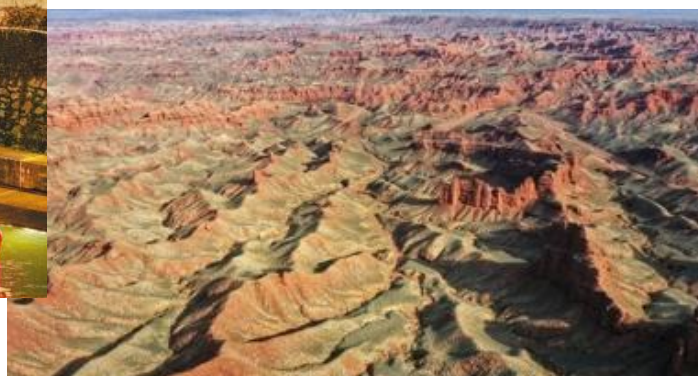
Pingshan Grand Canyon