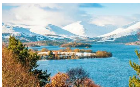
Loch Lomond, Scotland