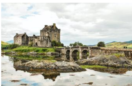
Eilean Donan Castle