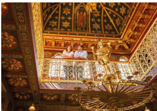
Inside Cardiff Castle