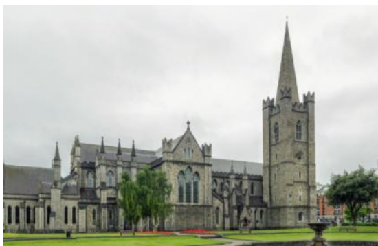
St Patrick's Cathedral, Dublin