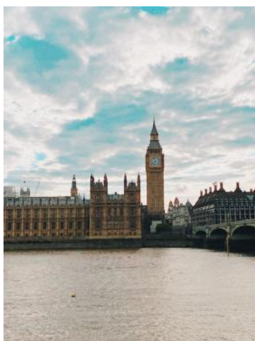
Icons of London