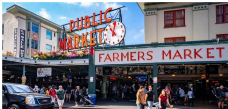
Seattle Space Needle and Pike Market (above)