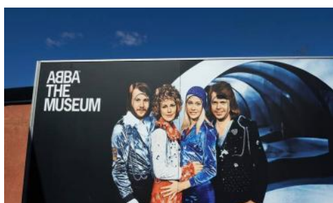
ABBA Museum - Stockholm