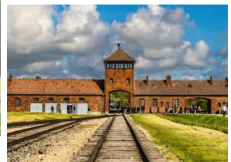
Auschwitz Concentration Camp