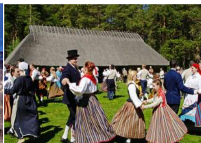
Estonian Open Air Museum