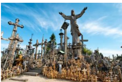
Siauliai—Hill of Crosses