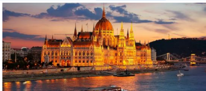
Budapest View from the Danube river