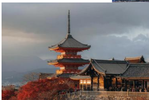
Above—Kiyomizu Temple (Kyoto)