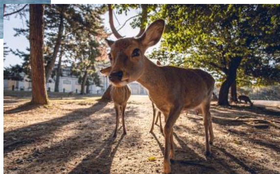
Right —Nara City