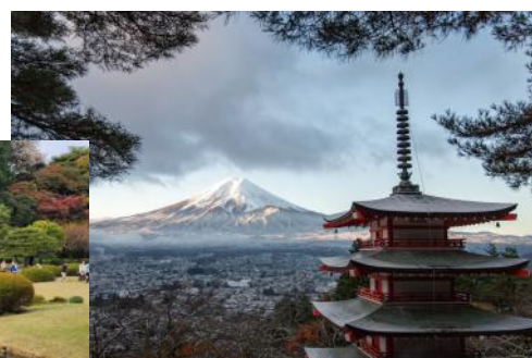
Beautiful Mount Fuji