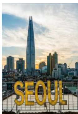
Above—Welcome to Seoul!