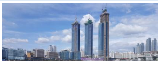
Left—vibrant city of Pusan