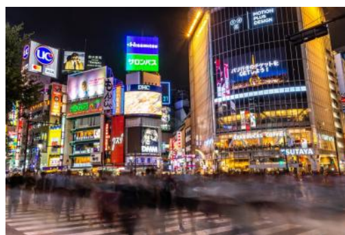
Tokyo—the city that never sleeps!