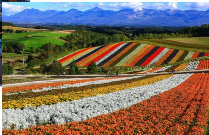
Biei Flower Garden