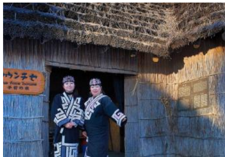
Shiraoi Ainu Village