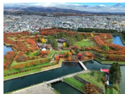
Goryokaku Fort Park