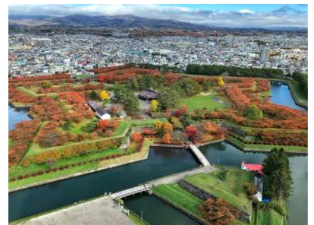
Goryokaku Fort Park