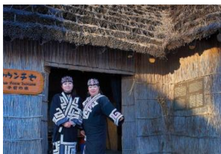
Shiraoi AINU Village