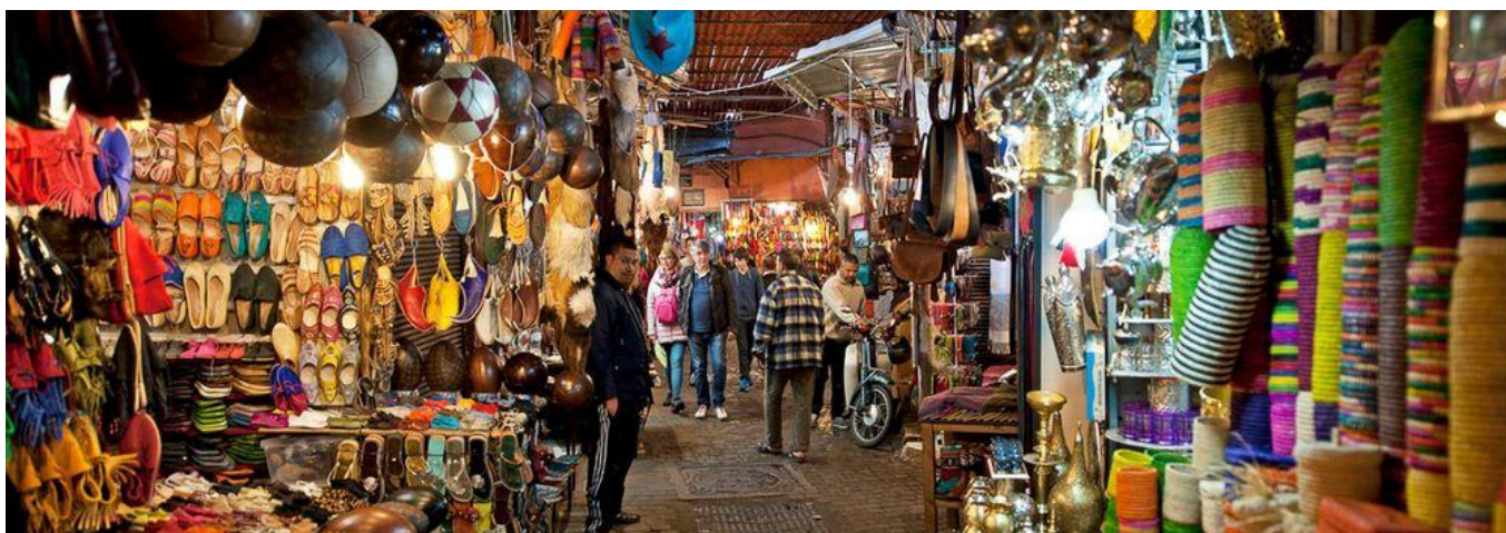
Bazaars of Baku City