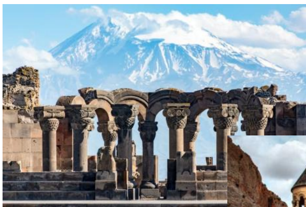
Ruins of Zvartnots—UNESCO Site