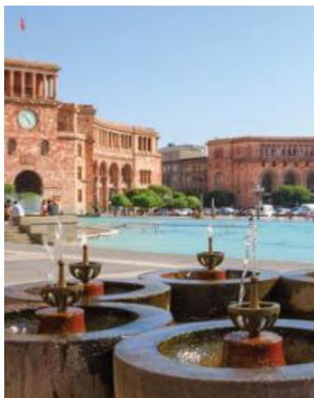
Republic Square - Yerevan