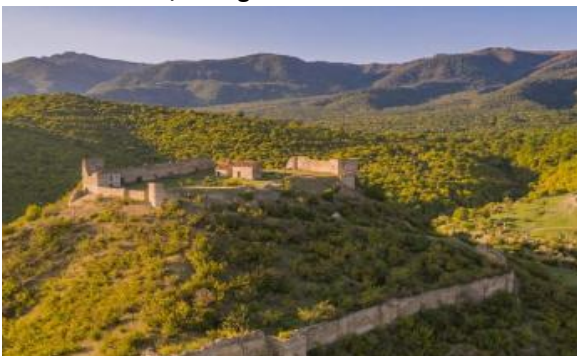
Manavi Fortress, Georgia