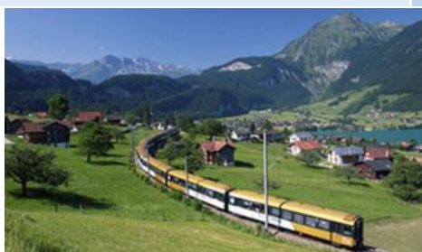
The amazing Goldenpass Swiss Train journey