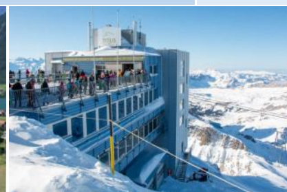
Mt Titlis Experience!