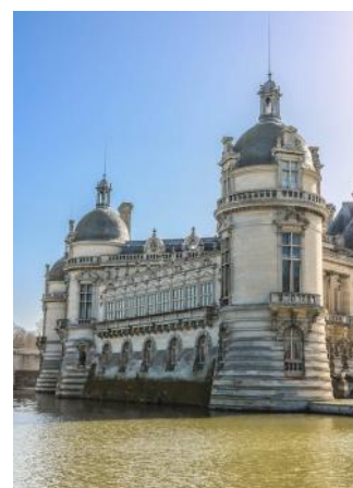
Right — Chateau de Chantilly (France)