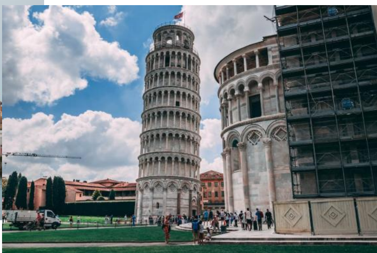
Leaning Tower of Pisa (Italy)