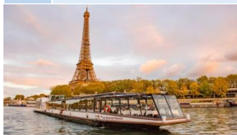
Cruise the Sienne River