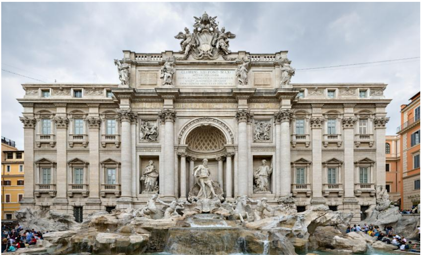
The City of Rome awaits!!