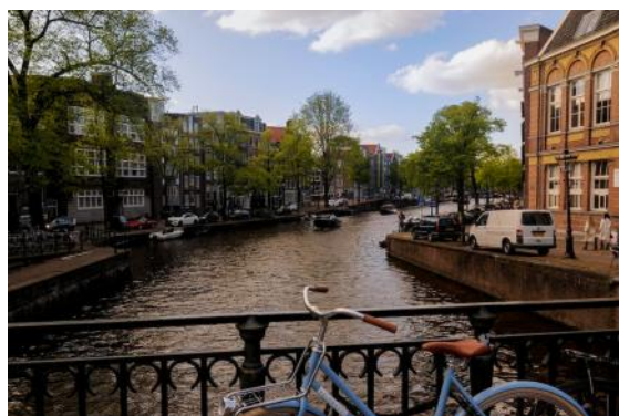
Left —Amsterdam Canals