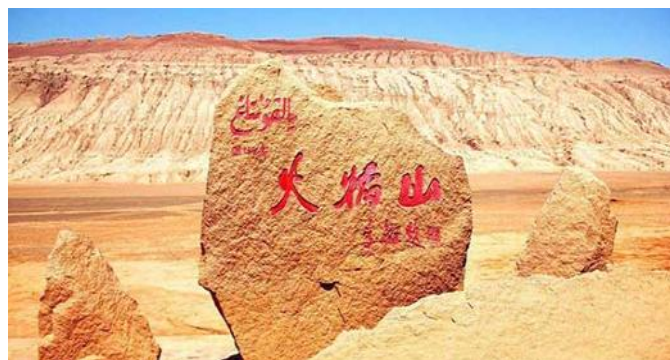
Huoyan Mountain, the "Flaming Mountains,"