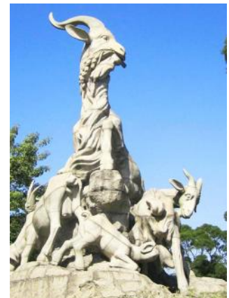
Five Rams Statue