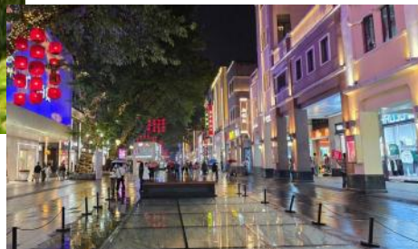
Beijing Road for shopping!