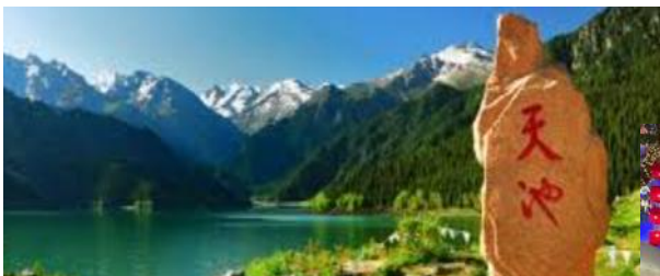
Urumqi - Heaven Lake