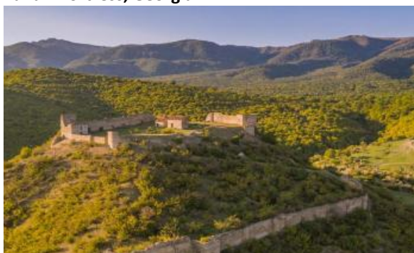
Manavi Fortress, Georgia