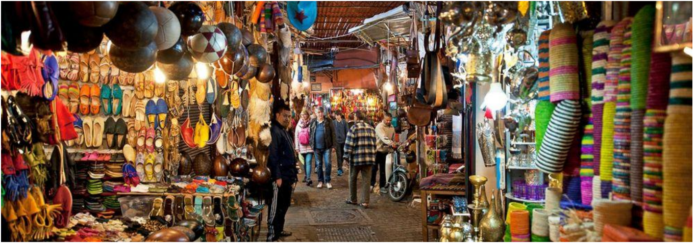
Bazaars of Baku City