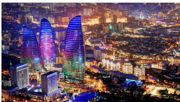
Baku City, Azerbaijan