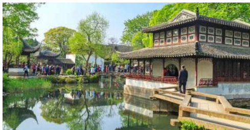
Humble Administrative Gardens, Hangzhou