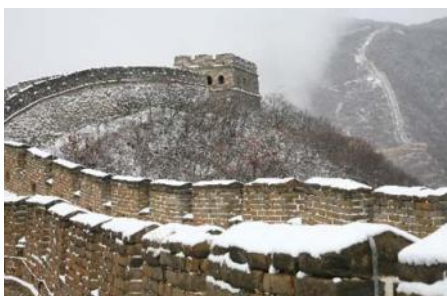
Mutianyu Great Wall, Beijing