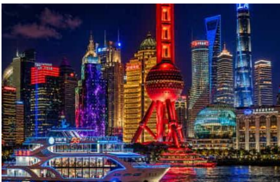
Evening Huangpu River Cruise, Shanghai