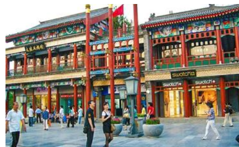
Qianmen Street, Beijing