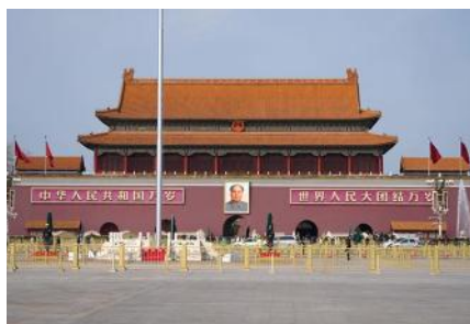
Tian'anmen Square, Beijing