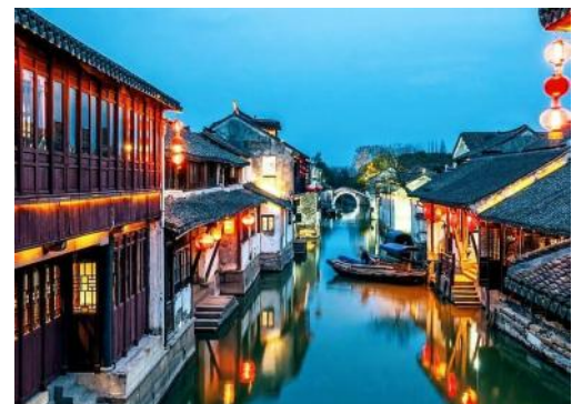
Zhouzhuang Water Village, Suzhou