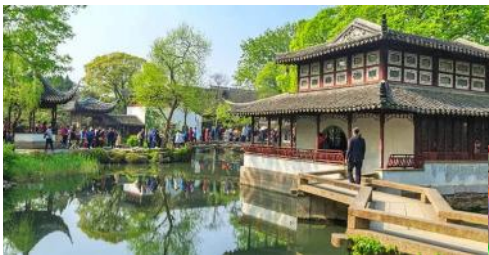
Humble Administrative Gardens, Hangzhou