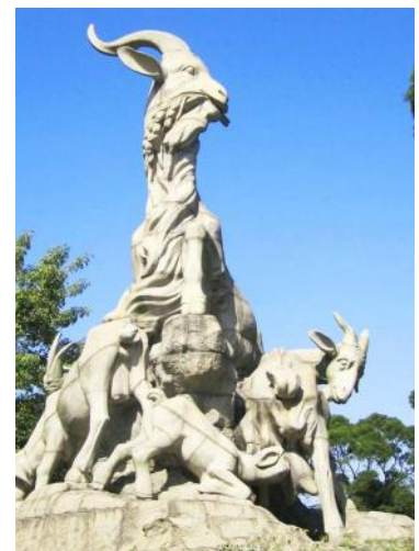
Five Rams Statue, Guangzhou