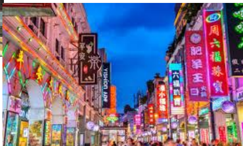
Shangxiajiu Pedestrian Street, Guangzhou