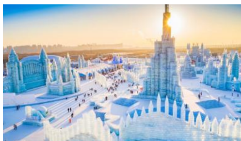
Harbin Snow Festival