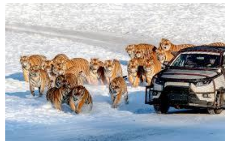
Siberian Tiger Park, Har-