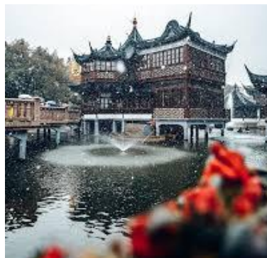
Yu Garden, Shanghai