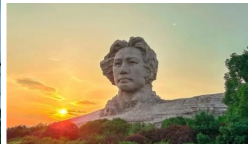
Mao Zedong Statue, Changsha