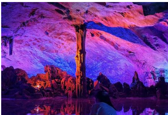
Reed Flute Cave, Guilin