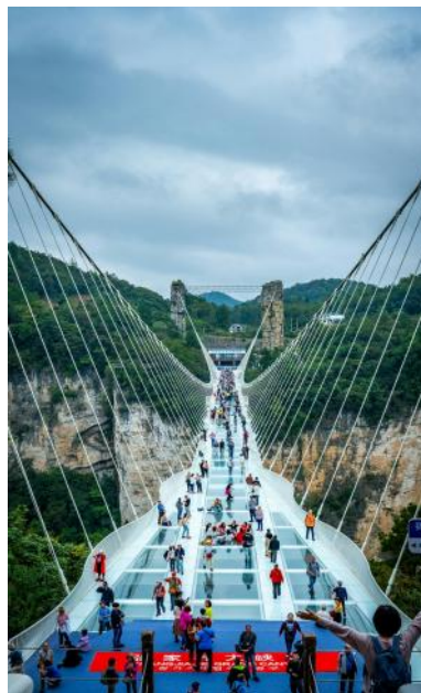
Zhangjiajie Grand Canyon