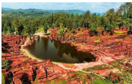
Red Stone Forest,