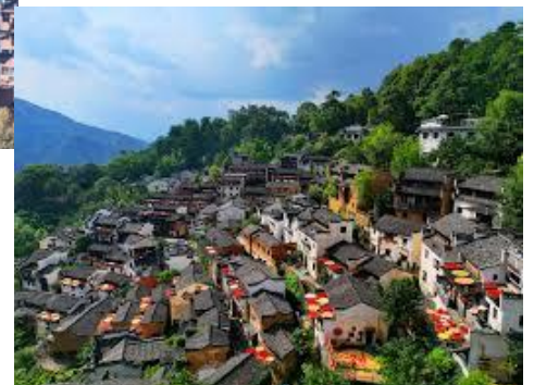
Wuyuan Huangling Scenic Area