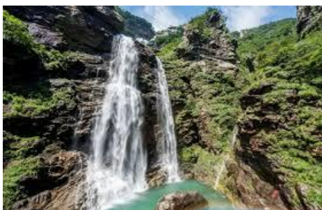
Lushan Mountain area