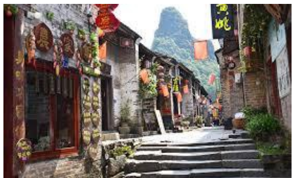
Daxu Ancient Town, Guilin