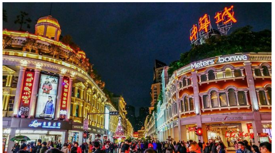
Zhongshan Road, Nanchang