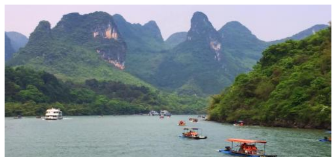
Li River Cruise, Yangshuo