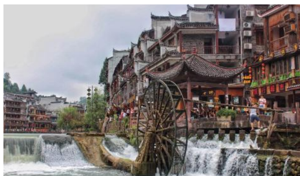
Fenghuang Ancient Town