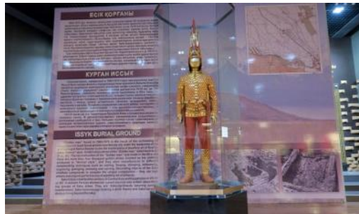
Tomb of the Golden man, Almaty