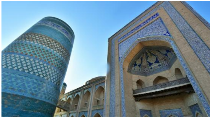
Kalta Minor Minaret, Khiva