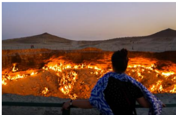
Darvaza Gas Crater