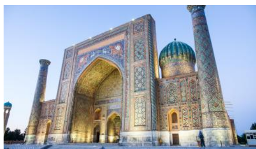
Registan Square, Samarkand