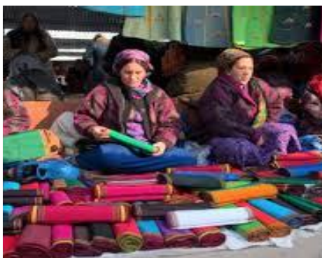
Typical Turkmenistan Bazaar