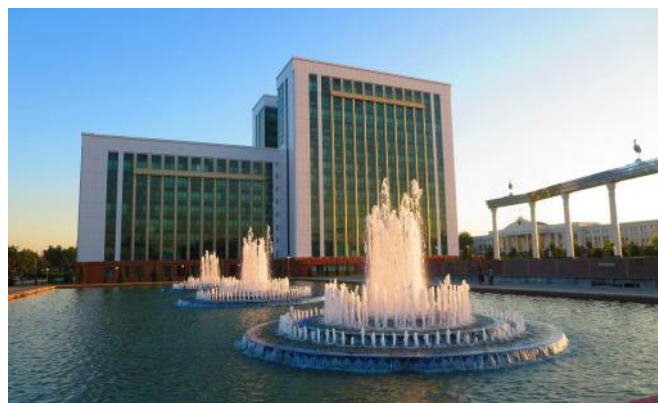
Mustaqilik Square, Tashkent