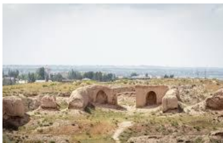
Ruins of Panjakent