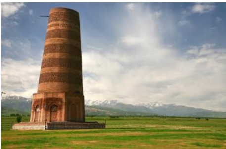
Burana Tower, Balasagun