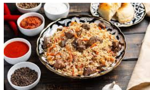
Plov, typical Tajik dish