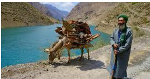
Haft Kul (7 lakes)