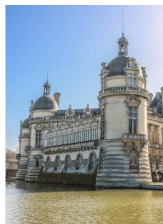
Right — Chateau de Chantilly (France)