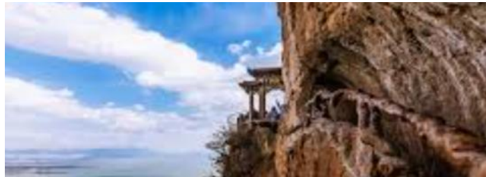
Western Hills Park—Dragon Gate