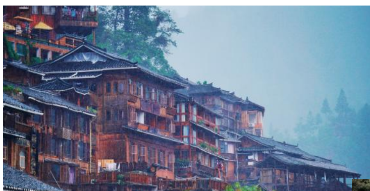
Xinjiang Miao Village