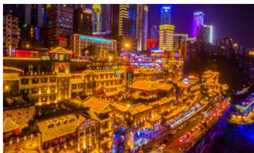
Hongya Caves (Chongqing)