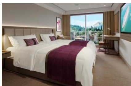
Century Cruise Cabin