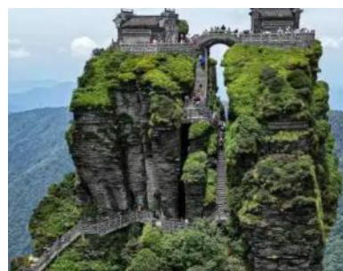
Fanjing Mountain (Tongren)