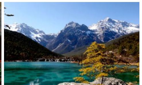
Jade Dragon Snow Mountain