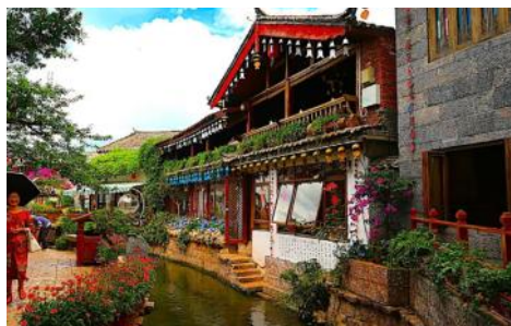
Lijiang Old Tow