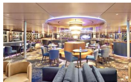
Vista Bar area