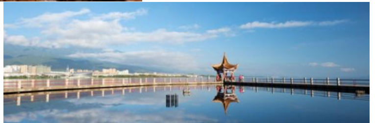
Erhai Lake (Dali)