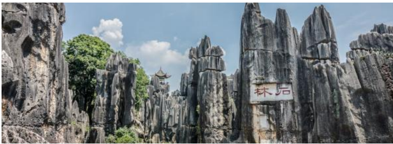
Kunming Stone Forest