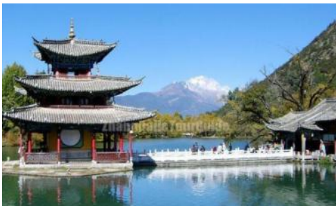
Black Dragon Pond Park (Lijiang)