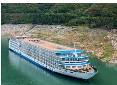
Century Cruise ship