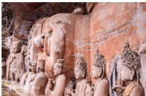
Dazu Grottoes (Chongqing)