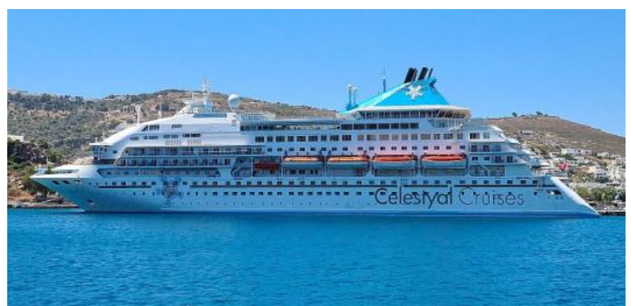
Celestyal Journey Cruise ship